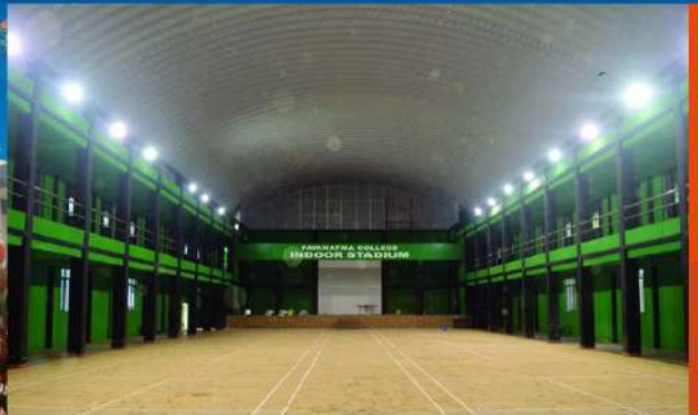
COLLEGE INDOOR STADIUM