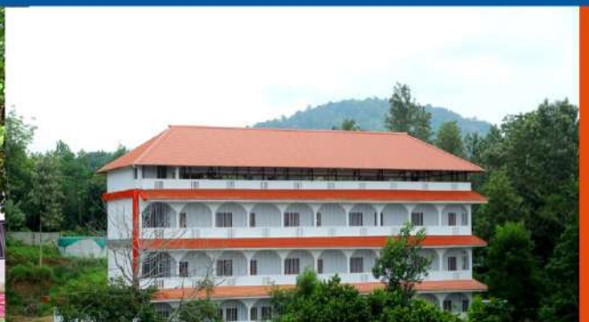
PAVANATMA HOSTEL FOR LADIES